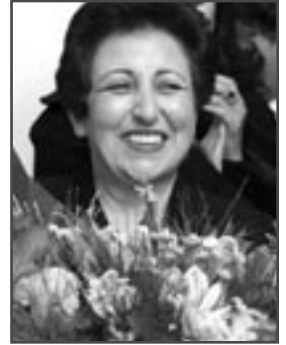
Shirin Ebadi accepting the Nobel Peace Prize

The lecture at UCSB's Campbell Hall on May 17, 2004, and the fundraising dinner on May 16, are open to the public and promise to be informative and inspiring events.