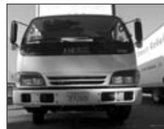
Our New 2004 GMC Turbo Deisel Truck