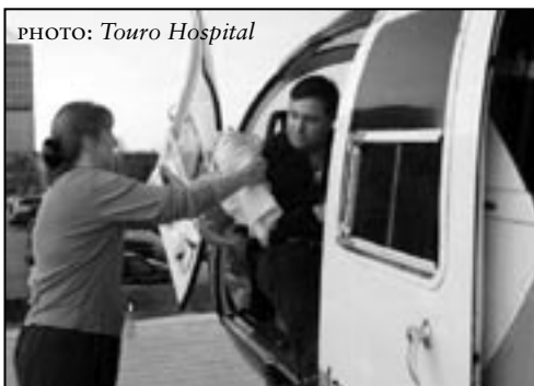
PHOTO: Touro Hospital Direct Relief provided essential medicines and supplies to 66 nonprofit clinics, hospitals, and shelters throughout the Gulf Coast region.

Direct Relief's support efforts have been aimed at both the major anchor facilities that provide specialized services and the network of safety-net clinics that play the key role in caring for people who have little money and no insurance. Both types of facilities have undergone tremendous strain from a surge in patient visits, lack of revenue, and in many cases, storm-related damage.