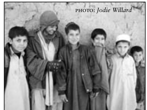
Children outside of the Village of Hope center in Mansehra, Pakistan, to which Direct Relief provided funding for faculty salaries, medicine, medical supplies, equipment, and office supplies. The center, run by the International Medical & Educational Trust, is a temporary home for 1,000 children orphaned by the earthquake and their living family members.

In addition, Direct Relief supports 12 hospitals, four mobile medical teams, four rural health centers, three prostheses centers, and three maternal-child health facilities throughout the affected regions.