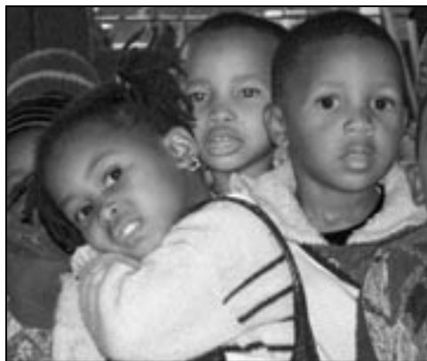
In addition to end-of-life care, South African hospices provide long-term care and services to patients and their families. The children above sing songs at a hospice-sponsored educational daycare facility.

Eighty-two percent of people under hospice care in South Africa are HIV positive. The network of hospices and trained hospice workers provide a growing source of palliative care and monitor HIV positive patients on antiretroviral therapy.