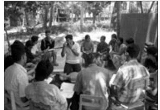
Direct Relief funded Sarvodaya to conduct first aid training programs for volunteer community health workers at its 30 health posts that Direct Relief also financed. Sarvodaya recruited another Direct Relief partner, St. John's Ambulance Sri Lanka, to conduct the training on a pro bono basis.

The Rainbow Clinic's services are completely free of charge, enabling access for low-income families as well as previously middle income families that lost property, assets, and livelihoods in the tsunami.